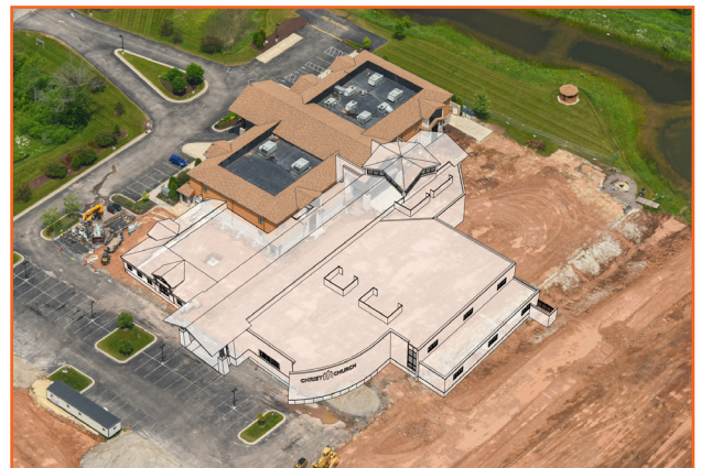
Christ Church Fall 2019

The harvesters are paid good wages, and the fruit they harvest is people brought to eternal life. "What joy awaits both the planter and the harvester alike!"